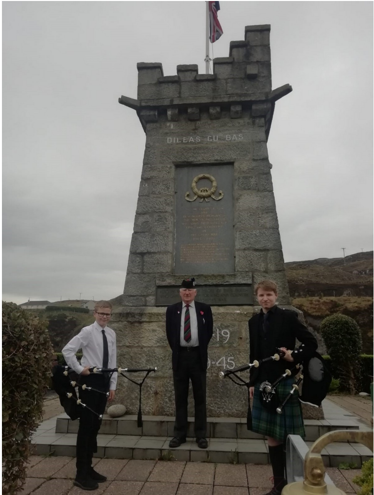
VE Day at Tarbert