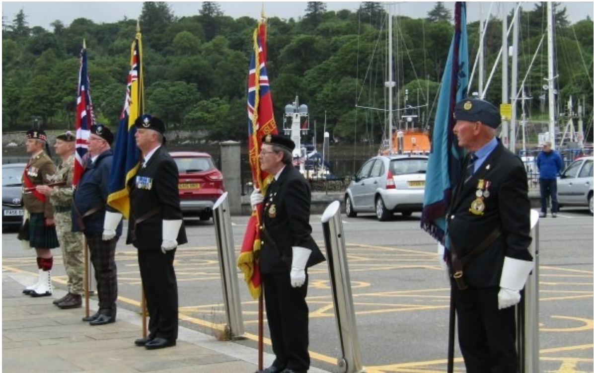
Armed Forces Day in Stornoway