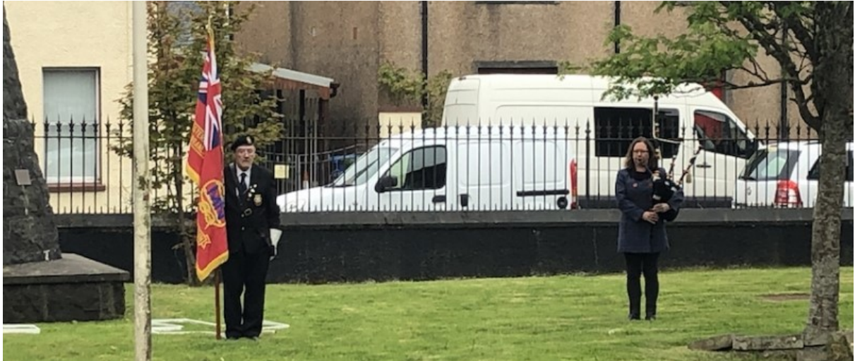
VE Day at the Drill Hall in Stornoway