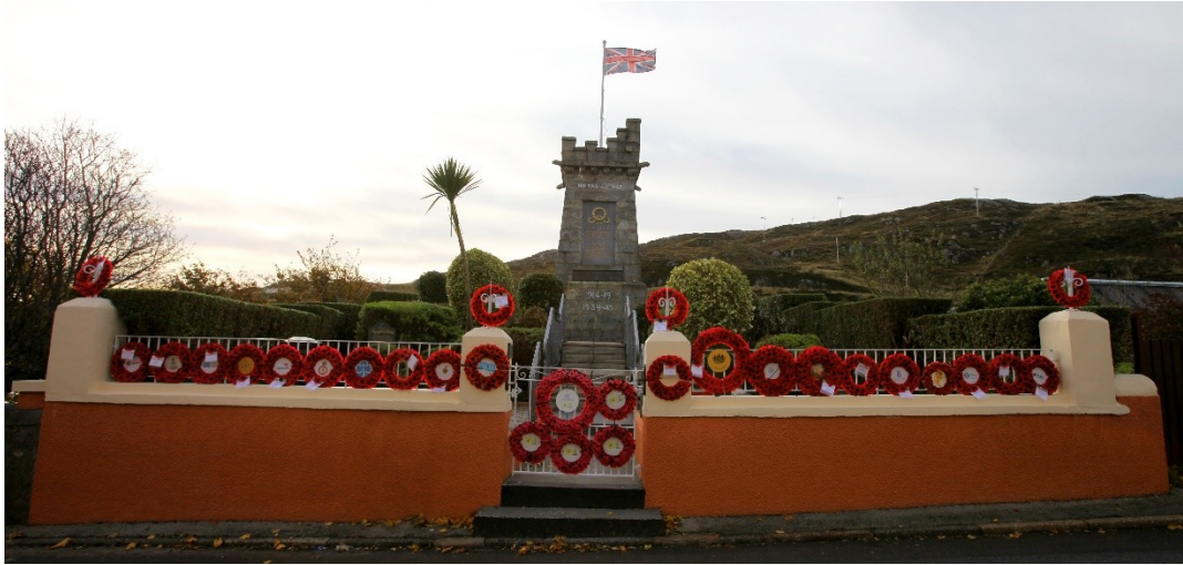
Tarbert War Memorial