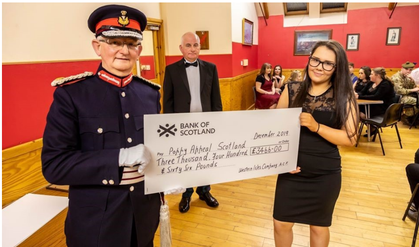
Army Cadet Force Event in December 2019