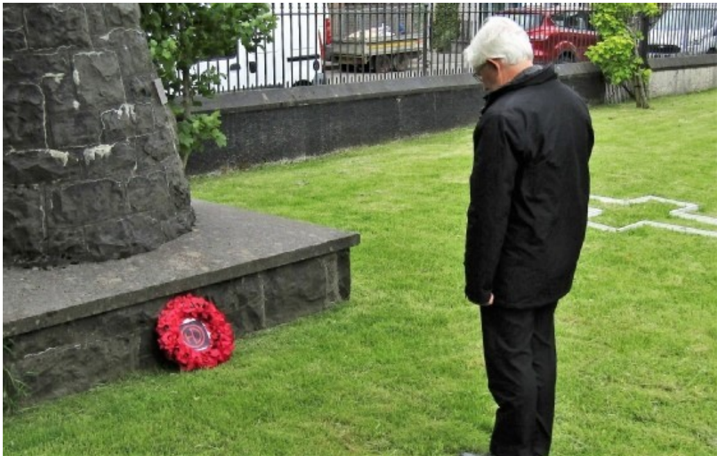
Saint-Valery-En-Caux Commemoration at the Drill Hall in Stornoway